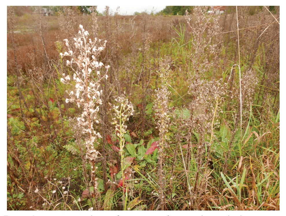
Figure 1. Decaying population of Erigeron canadensis in a dry grassland site in western Brandenburg (near Gülpe), previously subjected to mechanical disturbance (Photo by Daniel Lauterbach, October 2023).

Different abundances of E. canadensis might also induce different effects on plant community composition (Wang et al. 2021). A few conflicting experimental studies indicate negative, positive, or neutral effects, related to allelopathic effects (Shaukat et al. 2003; Djurdjević et al. 2011) and changes in soil biota (Řezáčová et al. 2020, 2021, 2022). However, it remains to be clarified whether changes in local communities caused by E. canadensis will lead to a long-term decline in species beyond the local level, potentially posing a threat to biodiversity. While the species frequently occurs in dry grassland on sandy soils in Brandenburg, negative effects on species of conservation concern are not expected since it usually temporarily colonizes gaps following disturbance (D. Lauterbach, personal communication, Fig. 1).