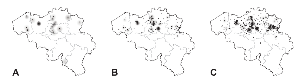
Figure 2. Map of Belgium with recorded occurrences of H. halys in A 2020 B 2021, and C 2022. Each dot is an individual record, and density clouds indicate the level of density of occurrences in one area.