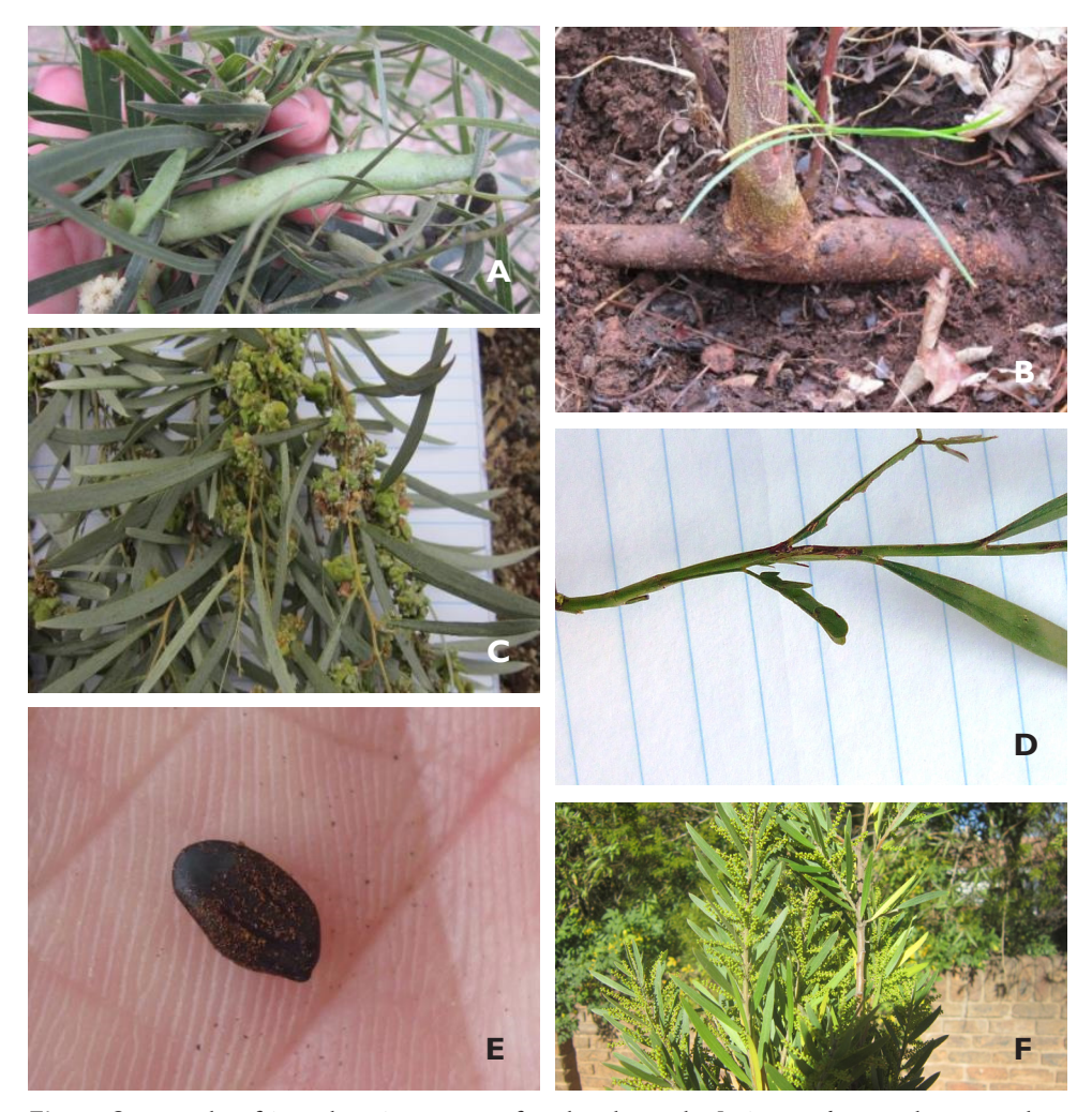
Figure 2. Examples of Australian Acacia species found in this study. A Acacia salicina with green pods in the Johannesburg Botanical Gardens B A. viscidula root sucker in a naturalised population in Newlands, Cape Town C A. pendula . Galls from a biological agent ( Dasineura dielsi ) released to control A. cyclops are visible in Bloemfontein D A. provincialis seedling showing juvenile bipinnate leaves attached to the stem and to the ends of the first few phyllodes, there are no bipinnate leaves on older phyllodes E A seed of A. piligera collected at Tokai, Cape Town F A planted individual of A. floribunda showing phyllodes and flower spikes in Johannesburg.

and so it was not possible to obtain molecular support for their putative identification ( A. piligera , A. provincialis , and A. ulicifolia ).