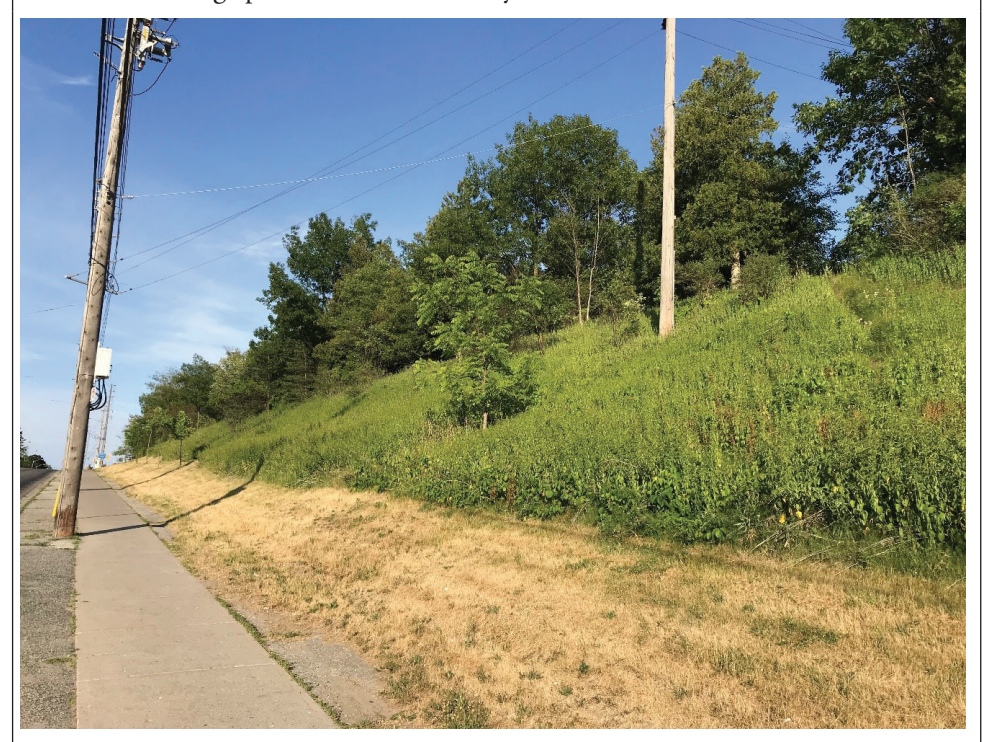
Figure B1. An urban site in Toronto, Canada, where the invasive Vincetoxicum rossicum forms a monoculture in open and understory habitats.

Having successfully overcome these barriers, V. rossicum negatively impacts native biodiversity – it reduces the diversity of plant and other trophic levels by excluding species with certain traits (DiTommaso et al. 2005; Ernst and Cappuccino 2005; Sodhi et al. 2019; Livingstone et al. 2020). It produces chemicals (Douglass et al. 2009) which can inhibit growth of other plants (allelopathy), alter soil biota, and make foliage unpalatable to native herbivores. It is considered the most impactful and difficult-to-manage plant invader in the city.