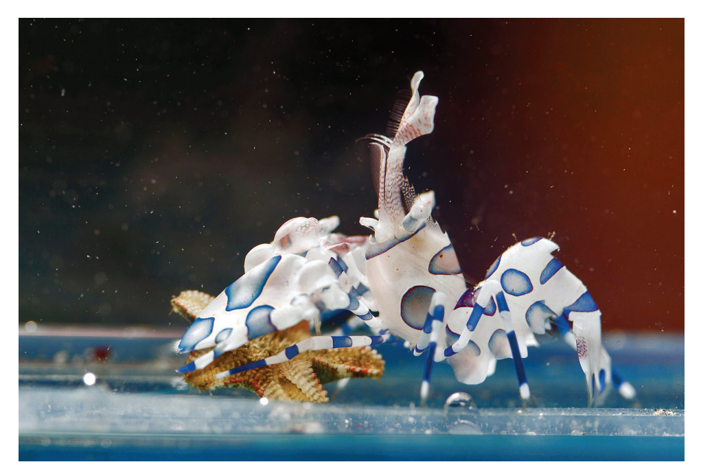
Figure 2. The obligate and voracious echinoderm predator Hymenocera picta (harlequin shrimp) turning an Asterina starfish upside-down and eating the soft tissue from the central disc.